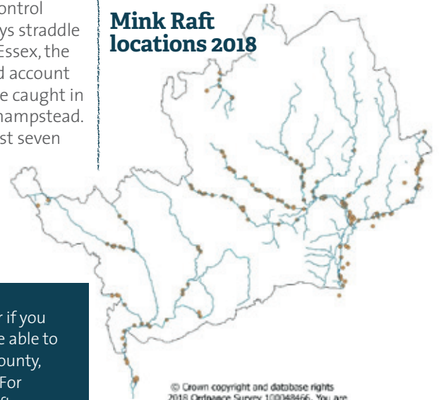
Mink Raft Locations 2018

© Crown copyright and database rights 2018 Ordnance Survey 100048466. You are not permitted to copy, sub-licence, distribute or sell any of this data to third parties in any form.