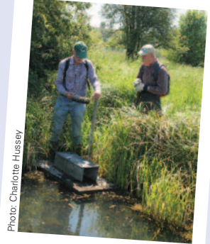
Water vole survey on the River Beane