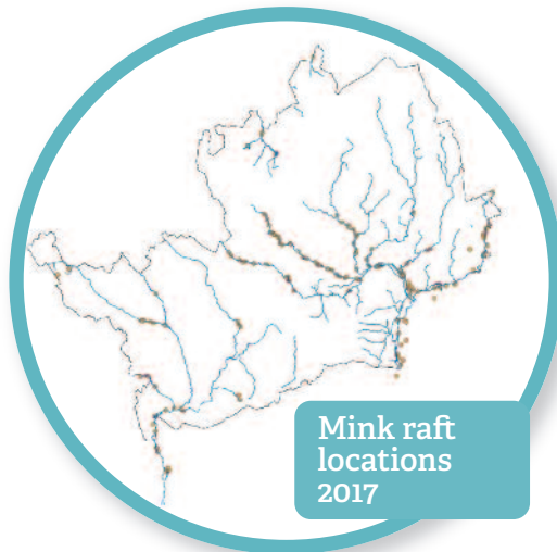
Mink raft locations 2017

is not down to the availability of water voles as prey! It does illustrate the importance of maintaining the mink control effort everywhere within the two counties.