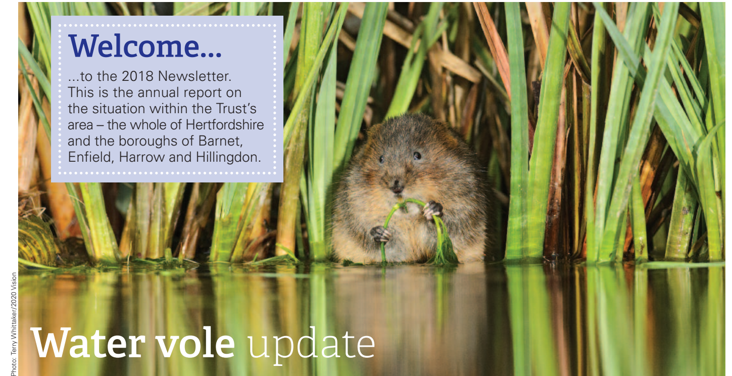
Vision

...to the 2018 Newsletter. This is the annual report on the situation within the Trust's area – the whole of Hertfordshire and the boroughs of Barnet, Enfield, Harrow and Hillingdon.