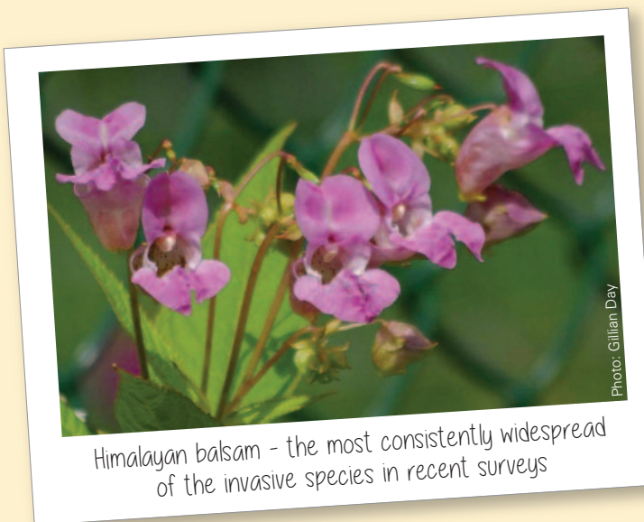
Himalayan balsam - the most consistently widespread of the invasive species in recent surveys