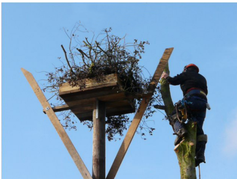
Putting the finishing touches to the nest. The adjacent tree was left in while the job was in progress, and felled once it was completed.