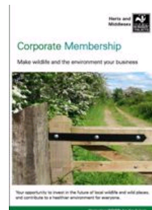
Corporate Membership Booklet