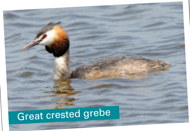
Great crested grebe