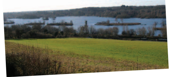
Broadwater Lake in the Colne Valley