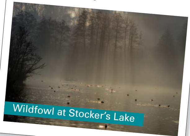
Wildfowl at Stocker's Lake