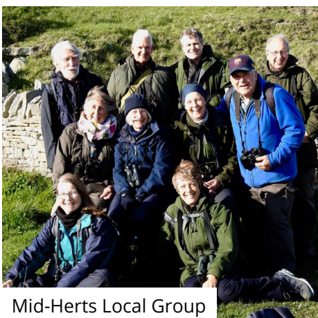
Mid-Herts Local Group

Our memory banks are stacked full of exquisite moments shared with the natural world in all weathers and in diverse locations many of which we or our highly