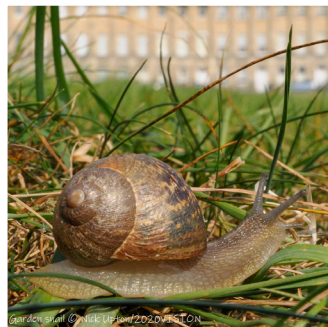
Garden snail

I have a top speed of 45 metres per hour.