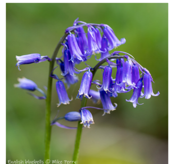
English bluebells