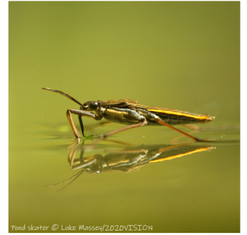
Pond skater