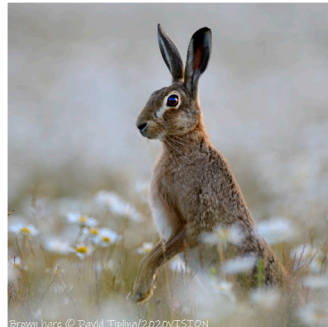
Brown hare

I can breathe through my skin as well as through my lungs.