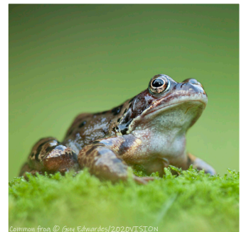
Common frog

I can breathe through my skin as well as through my lungs.