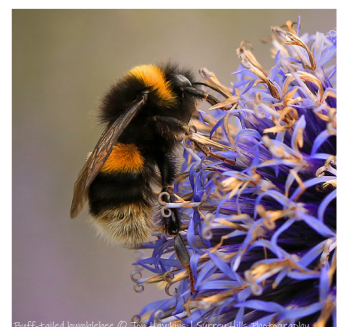
Buff-tailed bumblebee

I am the biggest of 24 species in the UK.