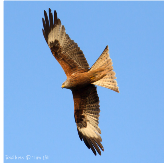
Red kite

I can spend several years in the air without landing.