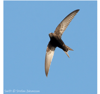
Swift

I can spend several years in the air without landing.